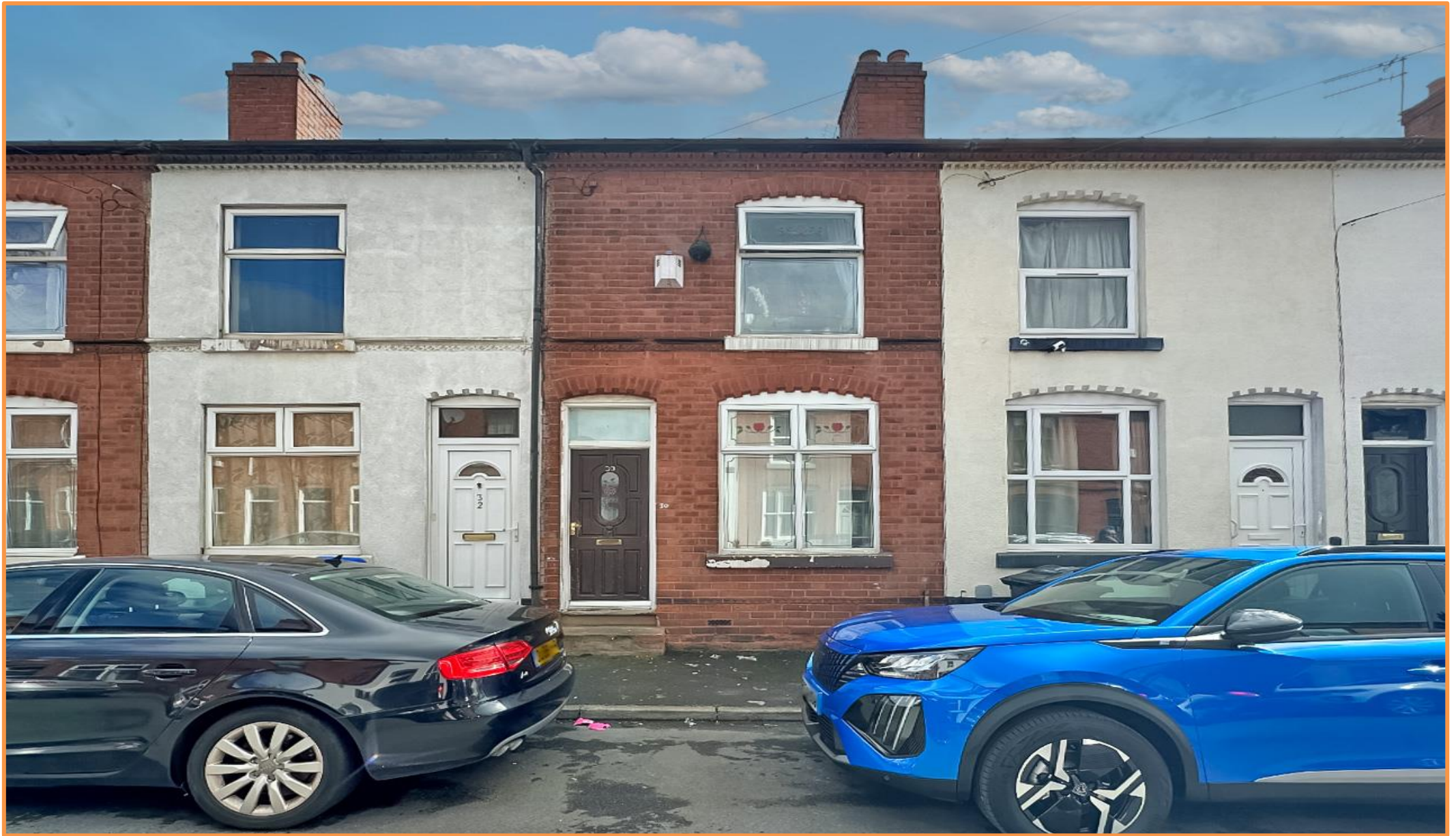
Moncrieffe Street, Chuckery Walsall, WS1 2LB